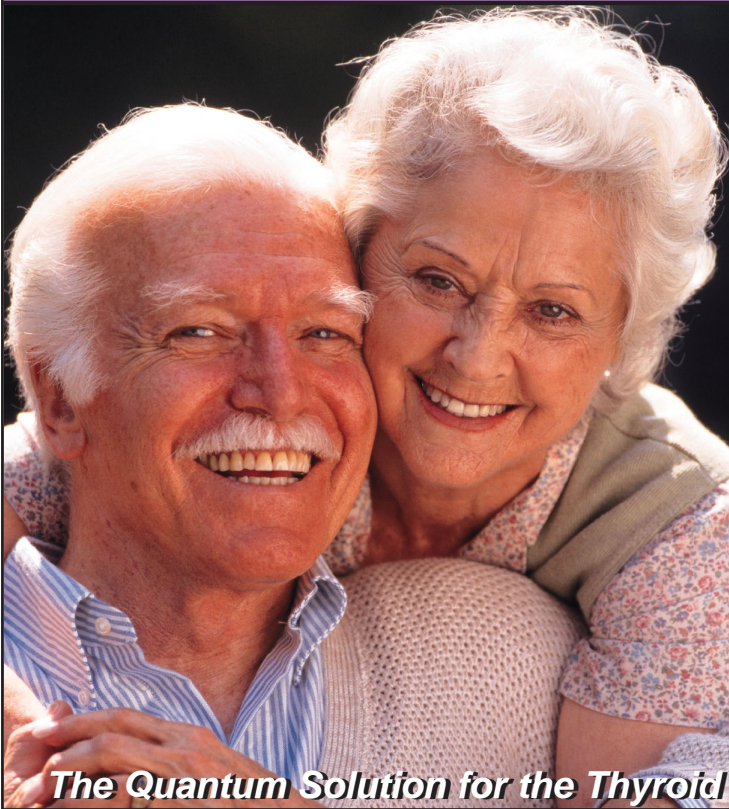
The Quantum Solution for the Thyroid!

Ideal Support For Thyroid Metabolism and Detox*